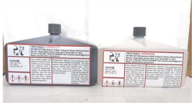
Domino A-Series Ink & MEK