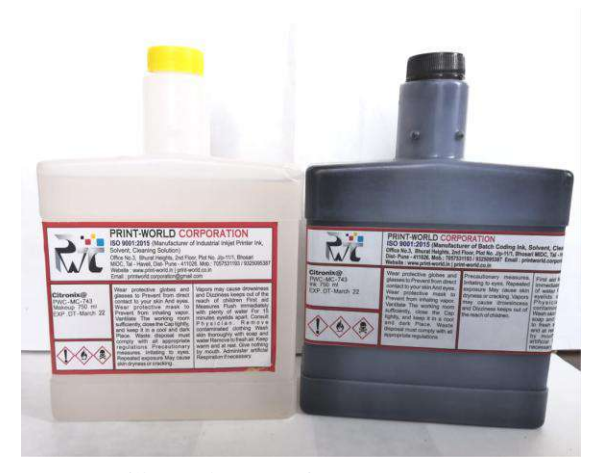
Citronix Ink & MEK