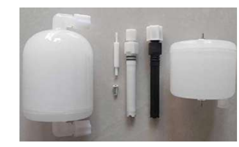
Linx Printer-Filter set