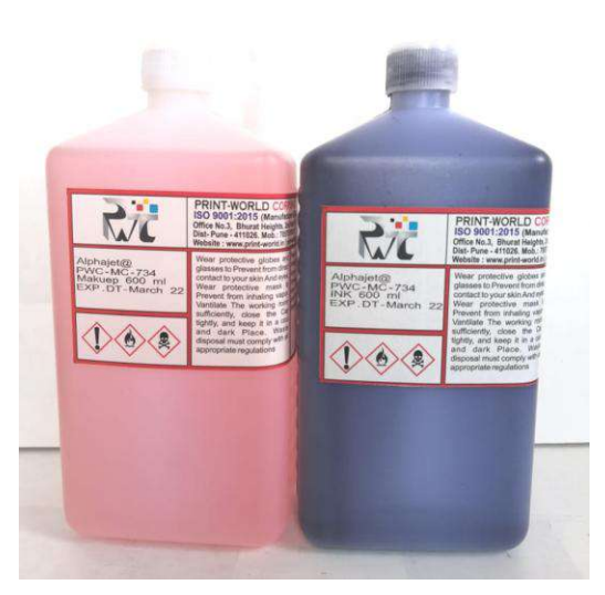
Alphajet(Control Print) Ink & MEK