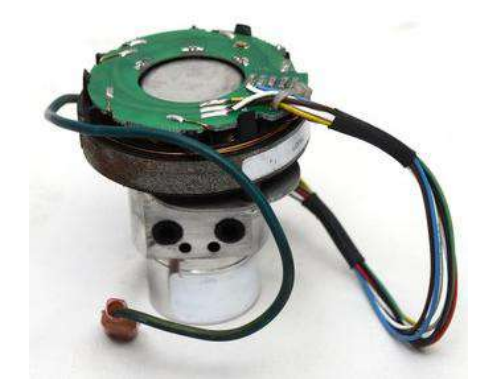
Videojet Core Pump