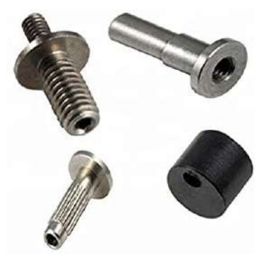
Domino Nozzle Assembly