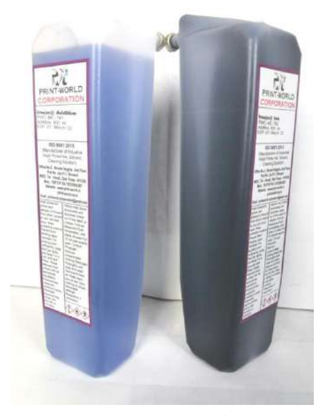
Markem Imaje Ink & MEK