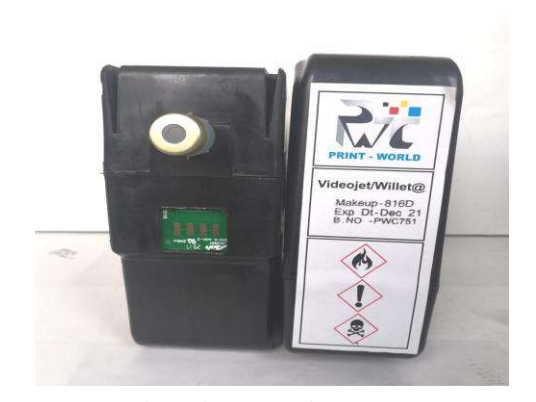
Videojet Ink & MEK