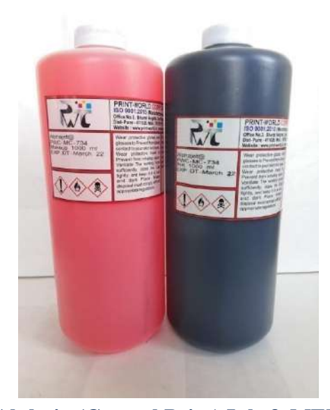
Alphajet(Control Print) Ink & MEK