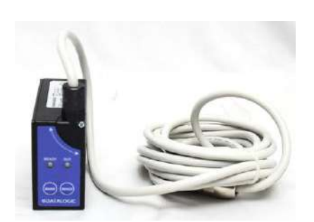
Eye Mark Sensor