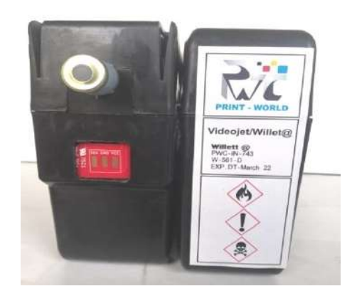
Willet Ink & MEK