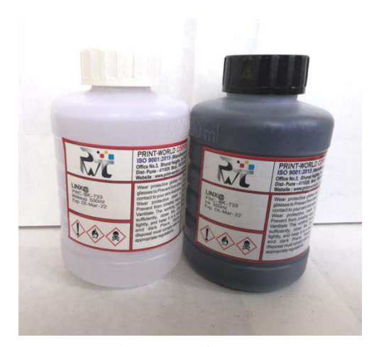
Linx Ink & MEK