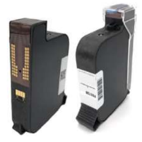
IQ 800 Cartridge