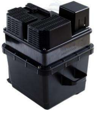
Videojet Printer Ink-Core