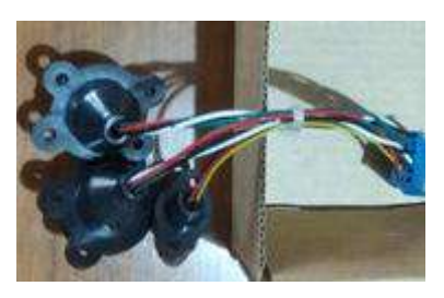
Videojet Pressure Sensor