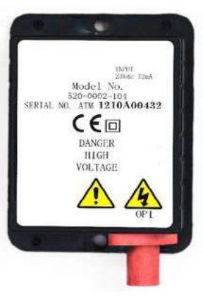
Videojet EHT Module