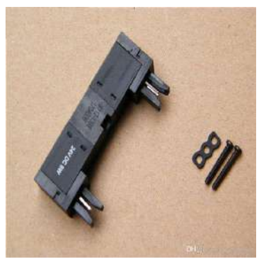
Videojet Core Valve