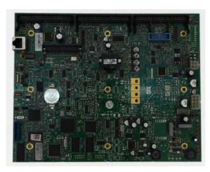
Videojet Main Board