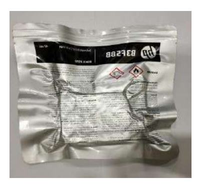
HP 2580 Cartridge