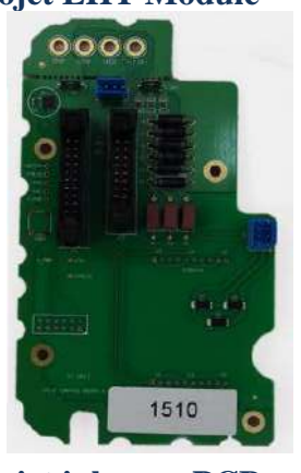
Videojet ink core PCB