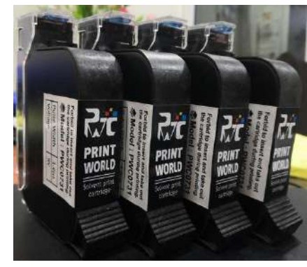
HP 1918 Dye Based Black Cartridges