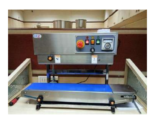
Band Sealing Machine