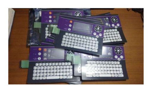
Imaje Printer Keyboard