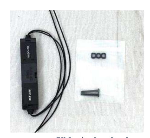
Videojet head valve