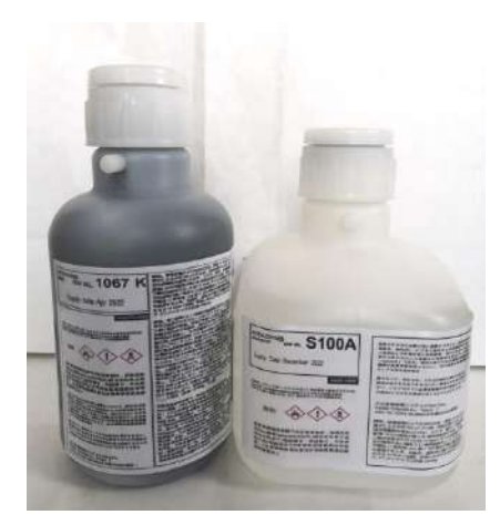
Hitachi UX Ink & MEK