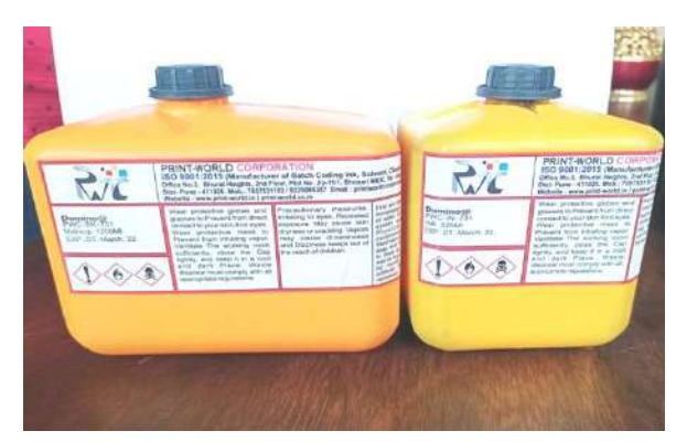
Domino I-Tech Ink & MEK