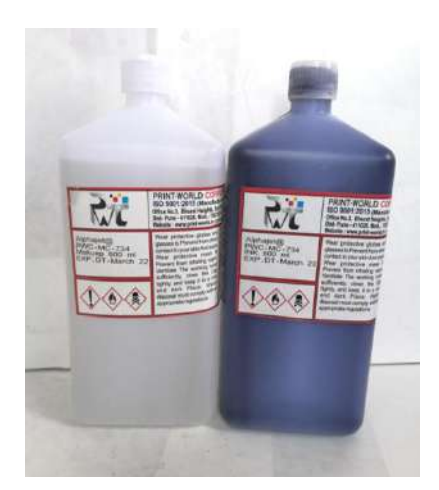
{\bf Alphajet}({\bf Control\ Print})\ {\bf Ink\ \&\ MEK}