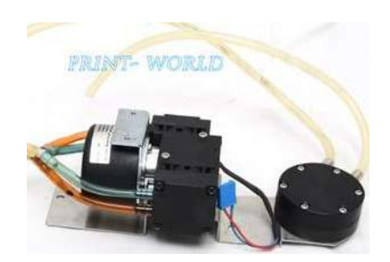
Videojet Positive Air Pump