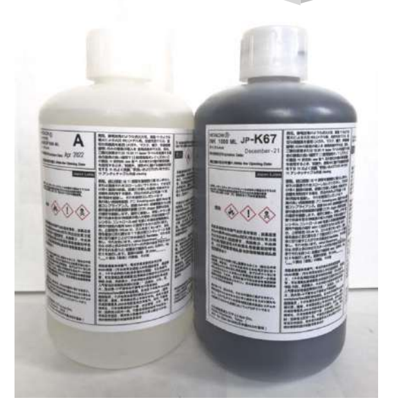
Hitachi Ink & MEK